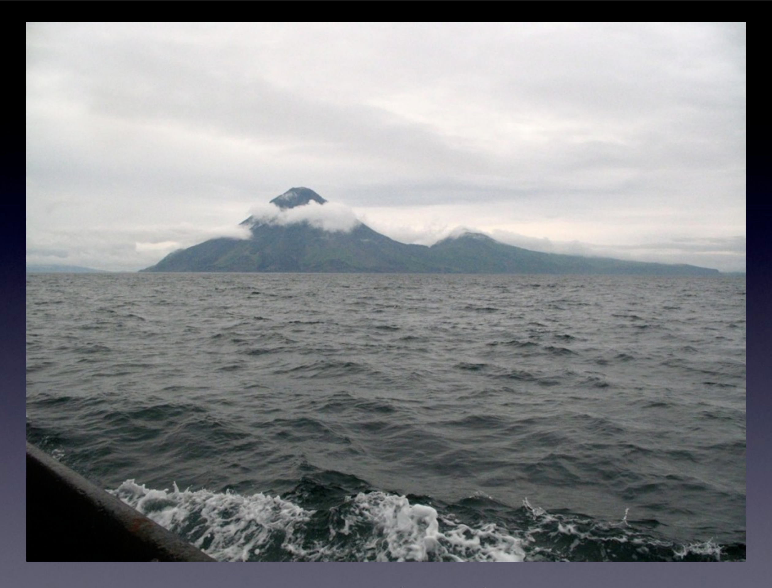
Kiska, a volcanic island near the tip of the Aleutians.